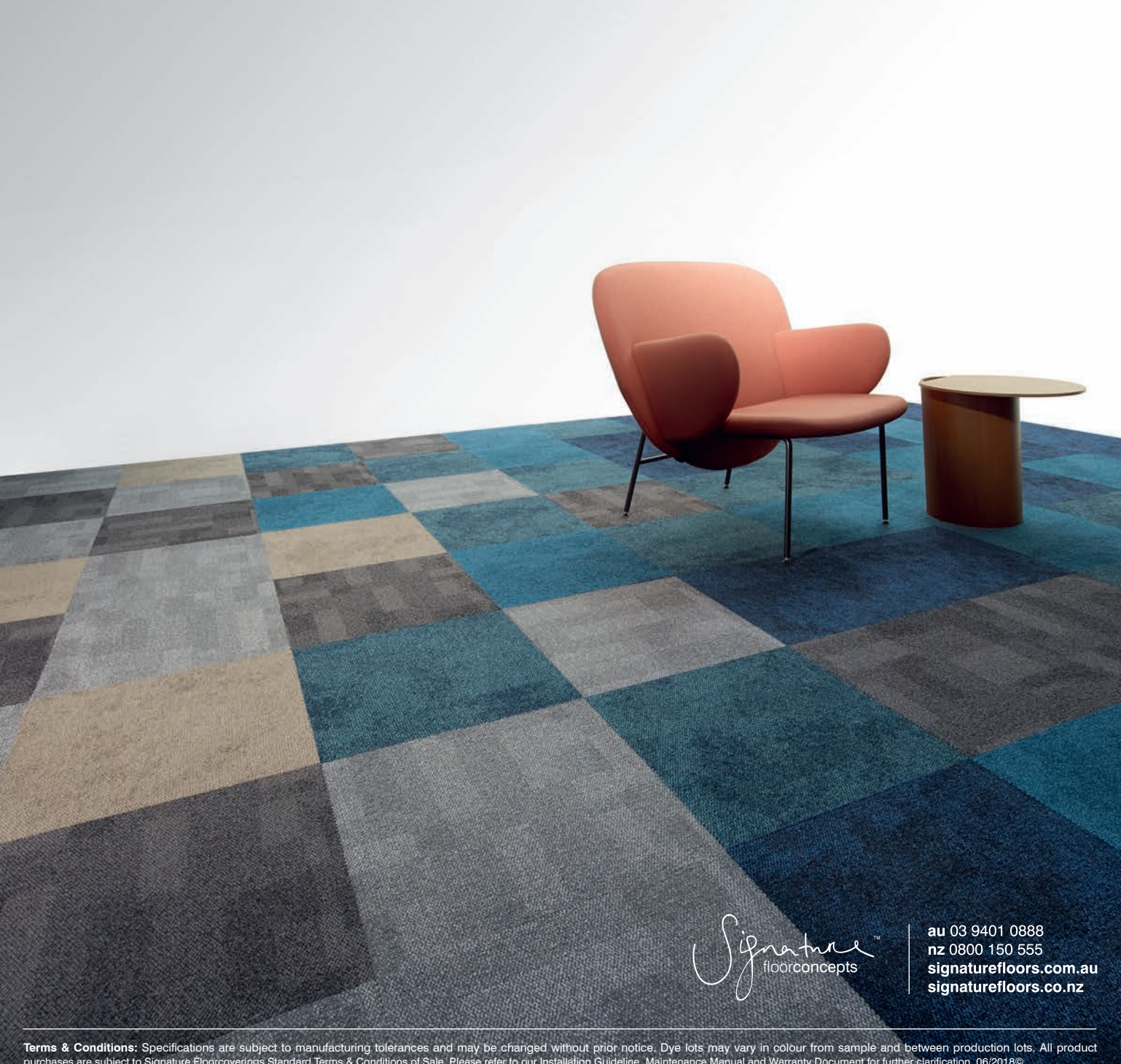
Terms & Conditions: Specifications are subject to manufacturing tolerances and may be changed without prior notice. Due lots may vary in colour from sample and between production lots. All product purchases are subject to Signature Floorcoverings Standard Terms & Conditions of Sale. Please refer to our Installation Guideline, Maintenance Manual and Warranty Document for further clarification. 06/2018®